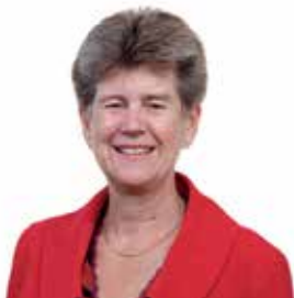
Jane Hutt AM

We want to make sure our ideas are right. Please tell us what you think by reading this document. And then filling in the response form.